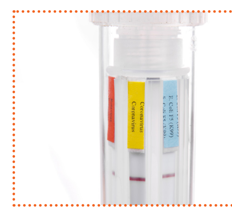
After 10 minutes, read the results using picture 11 as standard. For Clostridium perfringens interpretation use picture n°12.