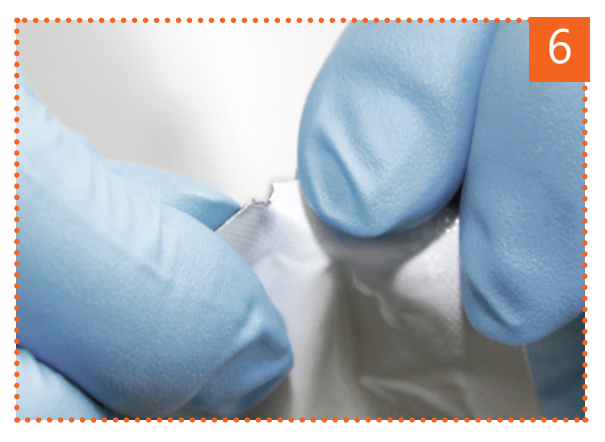
Tear the aluminium envelope open at the notch. Once the device has been taken out of the envelope its stability is of short duration, especially in a humid environment.