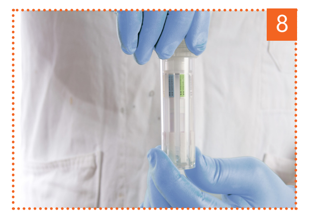
Screw the top of the strip tube.

You must hear two separate clicks, for perforation of superior and inferior septa of the sample tube.