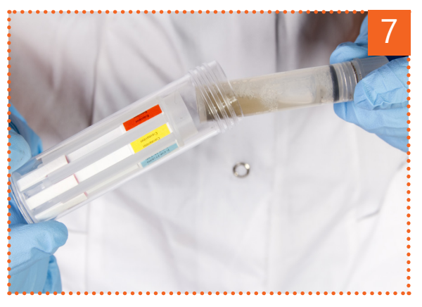
Insert the sample tube into the strip tube.

Bio-X Diagnostics is ISO 9001:2008 certified to assure the best to its customer